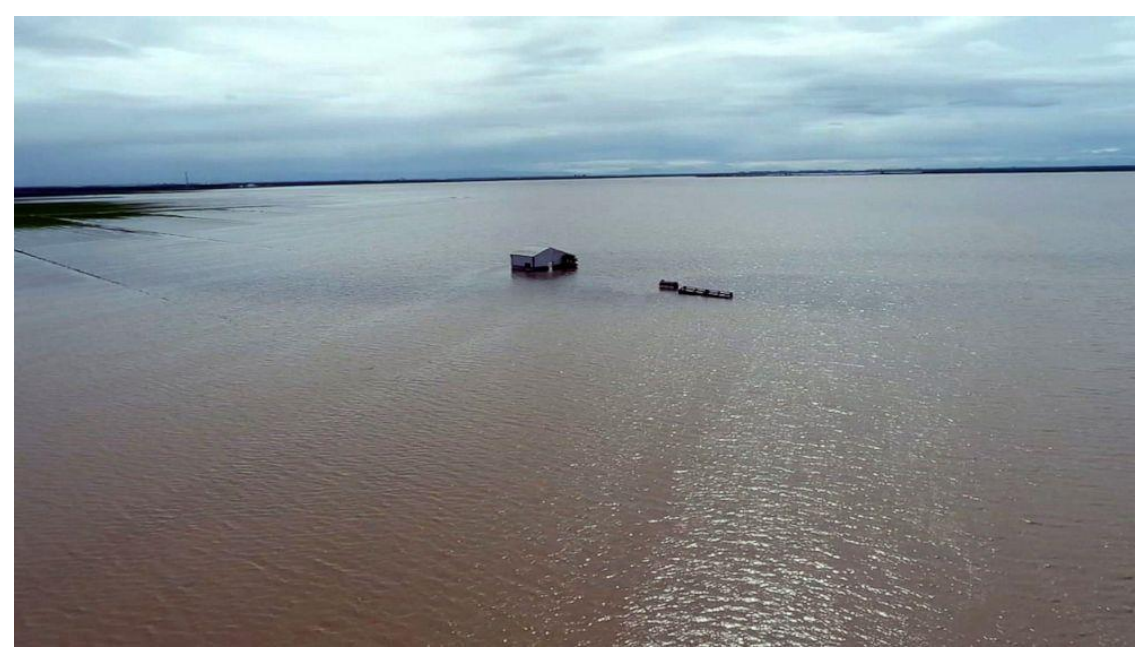
Flooding from Tulare Lake has encompassed streets, homes and farmland.