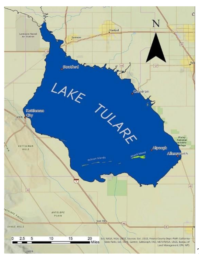
The lake has been dried up for 40 years.