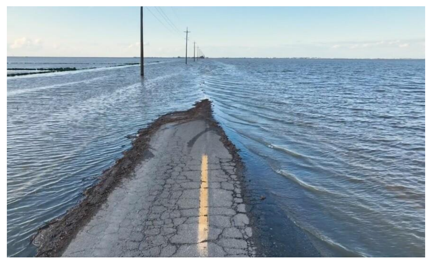
California ramps up help as Tulare Lake floods farms, homes, roads