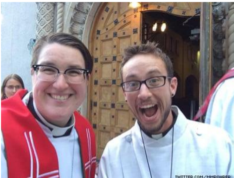
First Transpastor Officially Ordained by Evangelical Lutheran Church